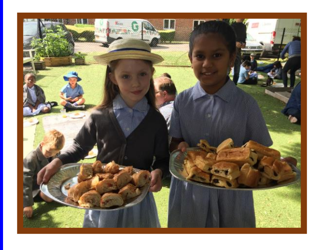
Our lovely Father's Day helpers serving up some tasty treats!

Thank you to all our dads and someone specials that came along and celebrated with a special breakfast last Friday at the Upper School.